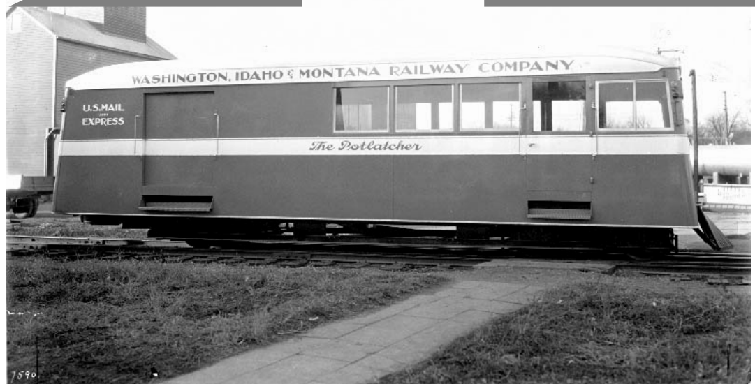
The Potlatch, a 12-seat rail bus with baggage and mail compartments, served the Washington, Idaho & Montana Ry. from its delivery in 1937 until the railroad's mail contract was dropped in 1955. This builder's photo of The Potlatch was taken just outside the plant where it was built in Fairmont, Minnesota. Part of the Rippe grain elevator, seen in the background, still stands today.